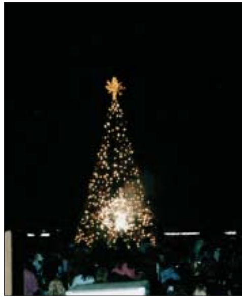
Holiday fireworks light in front of the city's Christmas tree.

Carnival games, bingo, free hot chocolate and adoptable animals from the Irving Animal Shelter were also a part of the evening's activity. Crafts, balloon art, face painting, letter writing to Santa and Santa visits took place in the Central Library Auditorium.