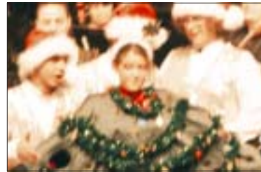
ISD Combined Choir sings with Philharmonic Orchestra