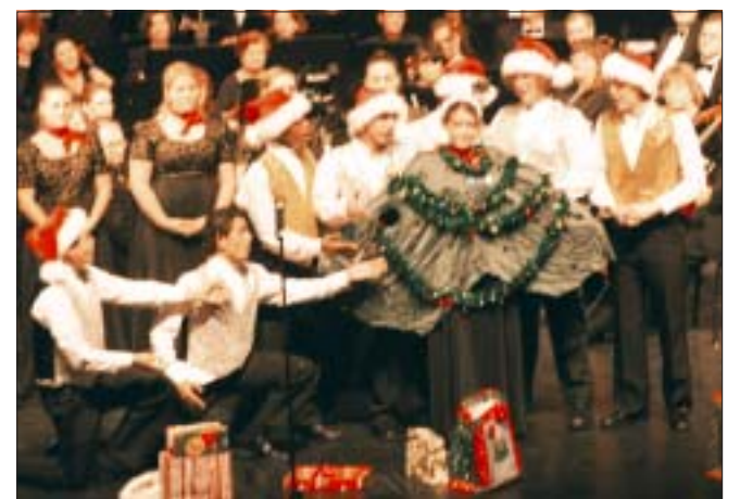
Irving High School's Singer Co. sings a nontraditional version of "Oh, Christmas Tree".