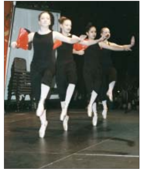
Local dance students performed selections from The Nutcracker Suite .