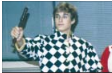
The Pied Piper performed for youngsters