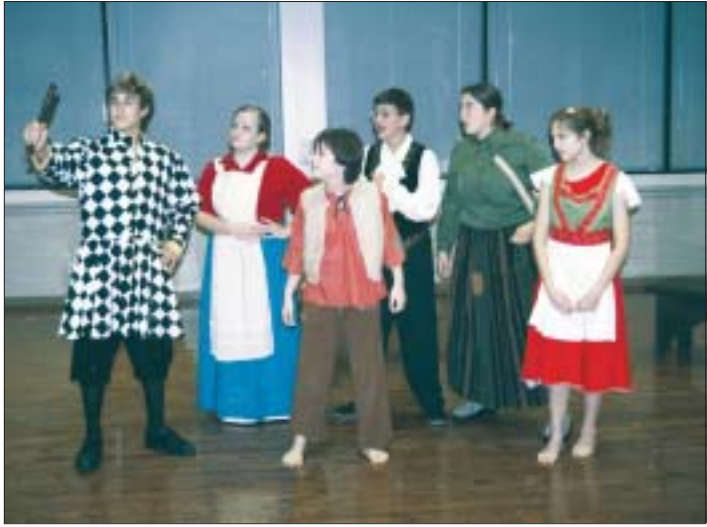
ICT Children's Theatre and Kids Arts perform The Pied Piper , a 30-minute, interactive play designed to entertain young audiences.

The Irving Arts Center began its free annual holiday celebrations including a Greeting Card Workshop, children's play and visits with Santa on Dec. 4.