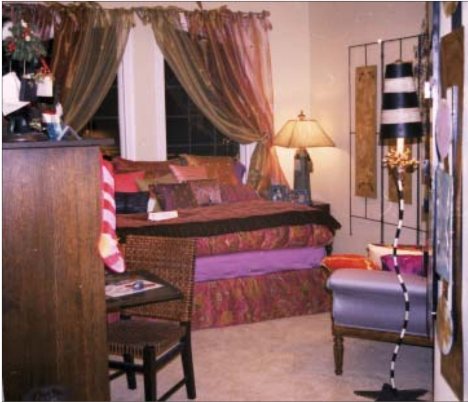
The "Make a Wish" room decorated in pinks and purples finds its inspiration in a little girl's wish trip to Australia.