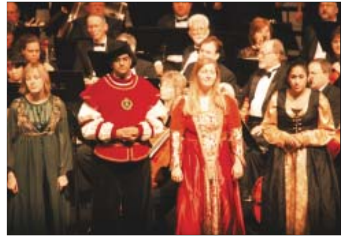
Nimitz High School's Madrigal Singers perform with the Philharmonic Orchestra.

Approximately 120 high school students comprising the Irving ISD Combined Choir performed in concert with the New Philharmonic Orchestra of Irving. The students sang Gloria by John Rutter and the Many Moods of Christmas by Robert Shaw with the orchestra. Each high school choir also had the opportunity to present selections as an individual choir.