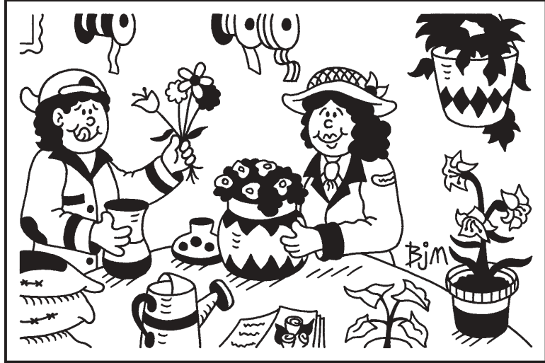
www.comparrotpuzzles.com