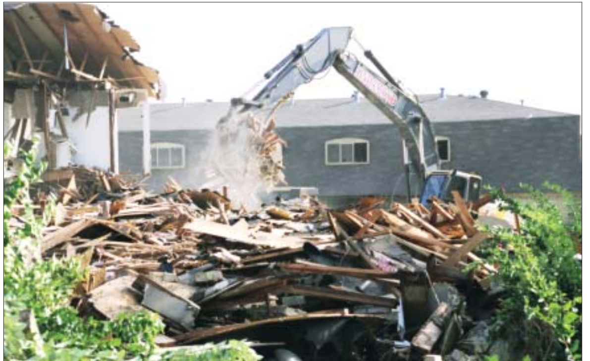
The long awaited demolition of the Villa Martinique Apartments begins on a sunny morning.

Early Monday morning a demolition crew began the work of razing the complex and clearing the land for new development. The demolition is expected to be completed within 60 days with the land cleared by the end of the year.