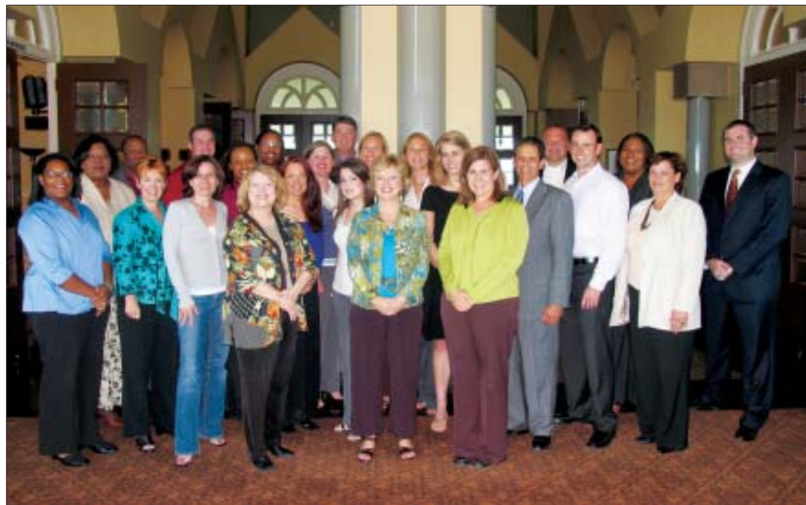
The Leadership Irving-Las Colinas Class of 2008 began their eight-month program early in September. The class will meet once a month through April, focusing on aspects of the City of Irving and Leadership Development.

The class will meet once a month through April and will focus on a different area of the City and development at each meeting.