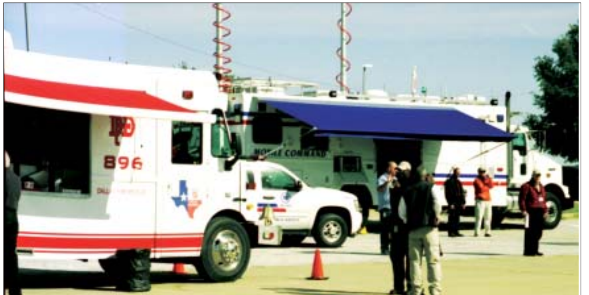
First responders and relief agencies from across north Texas test their ability to communicate effectively during a disaster.