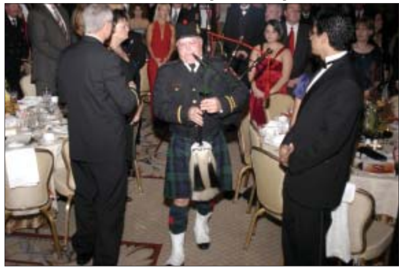
Traditional music brings guests to their feet during the second annual Irving Firefighters' Ball.

The Irving Firefighters' Ball committee thanks all those involved from the sponsors, to our volunteers, to the men of the Irving Fire Department whose character and pride in what they do ignites within each of us a civic pride and respect for them.